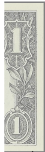
YOUTH SPORTS SCHOLARSHIPS