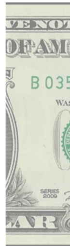
SENIOR WELLNESS SUPPORT