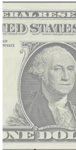
CAMP/AFTER SCHOOL SCHOLARSHIPS